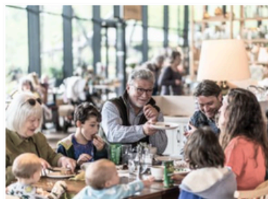
The Savill Garden Kitchen