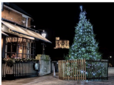
Côte Brasserie Windsor